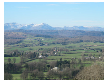
Resting at the Hospice & (left) St Peter's sitting proudly at the centre of the parish (but a bit small in the pic!)