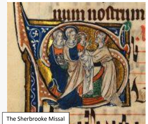
The Sherbrooke Missal