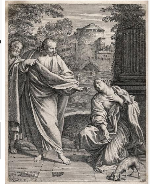
The Canaanite (or Syrophenician) Woman asks Christ to cure her Daughter Etching by Pietro del Po c1650.

'He has done everything well; he even makes the deaf to hear and the mute to speak.'